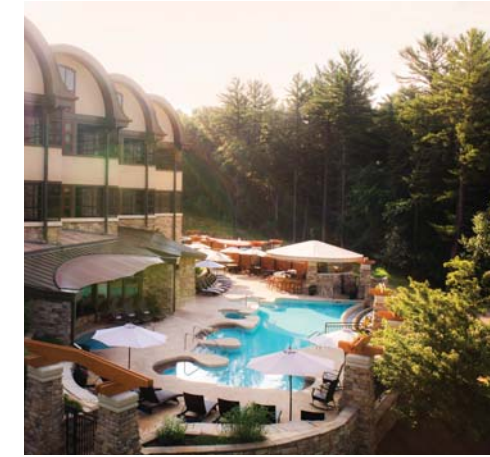
CLOCKWISE FROM TOP LEFT: The Spa Club sauna at Sans Souci Spa; the pool at Sundara Inn & Spa; sleek interiors at the SHA Wellness Clinic.

While the products make a difference, it's how they're used that creates a point of distinction. World-class spas all use top brands or bespoke products in creating their signature treatments, but ask what makes them special and they give the same answer – the staff. "You can have a beautiful property. You can have a beautiful location. You can offer wonderful services, but if you don't have warm, welcoming, friendly, trained staff, then it doesn't matter. No-one is going to come," claims Disch, a sentiment echoed by Igor Mitric, treatments manager at the Bulgari Spa in London's Bulgari Hotel.